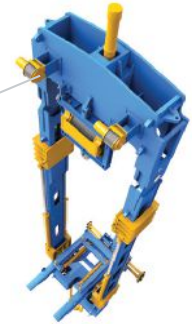
Coiled Tubing Lift Frame